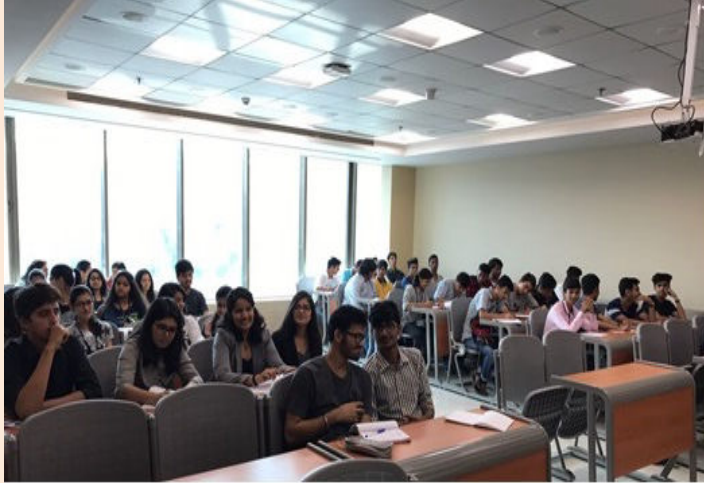
GIET Polytechnic organised Seminar on 3D Printing of Emerging Technology on 12.02.2023