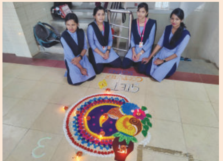
GIET Polytechnic organised Art & Draft Competition 11.03.2023