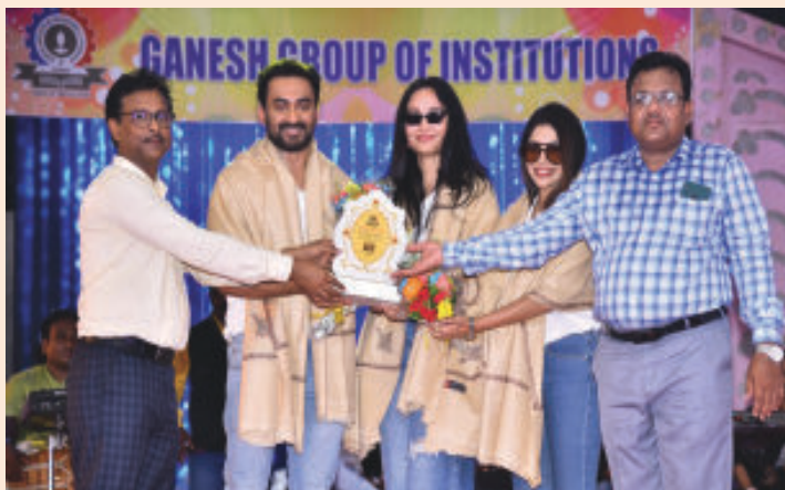
GIET Polytechnic organised Annual Function 06.05.2023