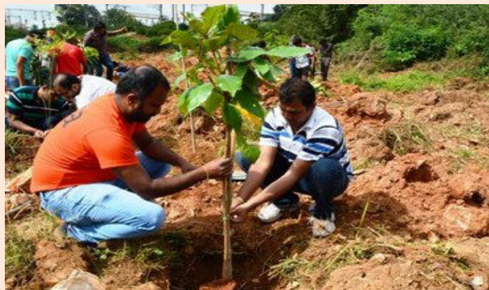
GIET Polytechnic organised Plantation Drive on 10.06.2023