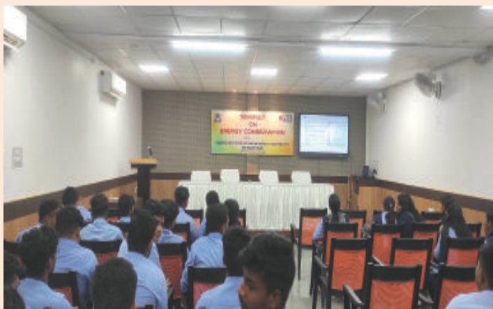
GIET Polytechnic organised Seminar on Energy Conservation 10.04.2023